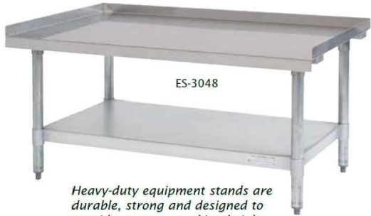
Heavy-duty equipment stands are durable, strong and designed to provide accurate cooking height.